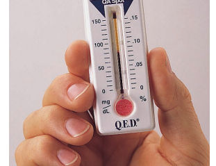
3. Read color bar.