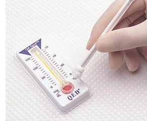
2. Insert collector into test device.