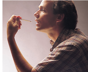
1. Swab mouth to collect saliva.